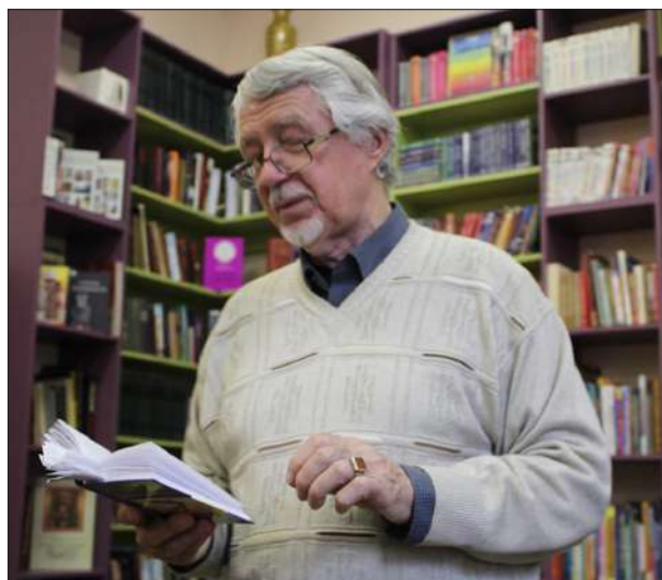
Speech at a literary gathering.

We wish him realization of his creative plans!